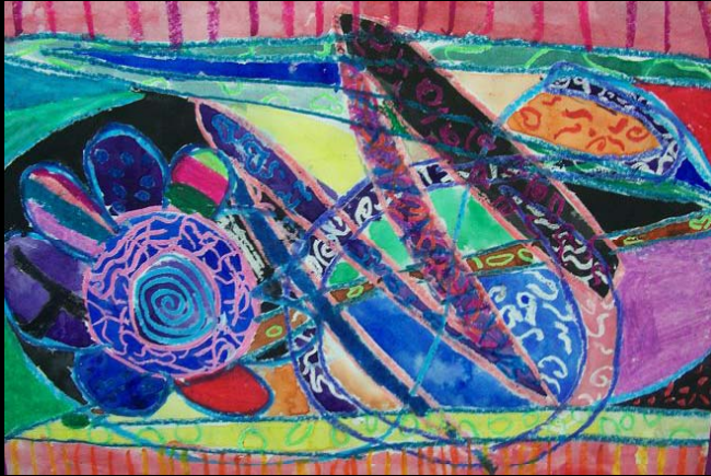
Davis and Lane Schools