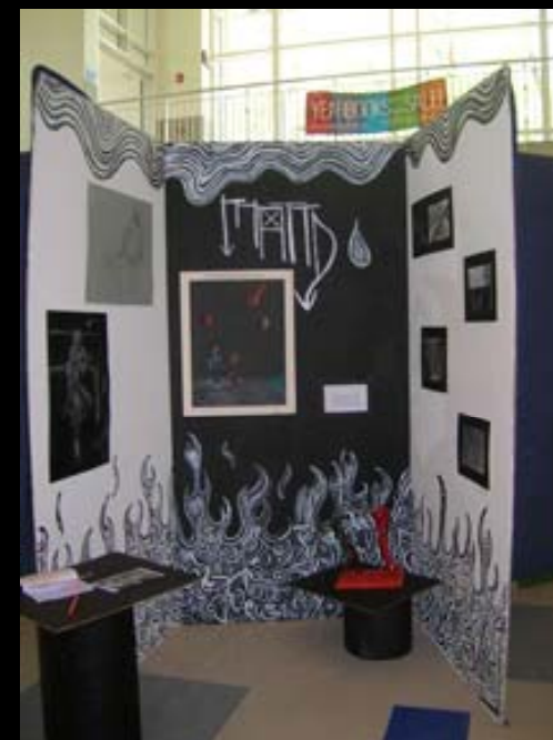
K- 12 Art Show