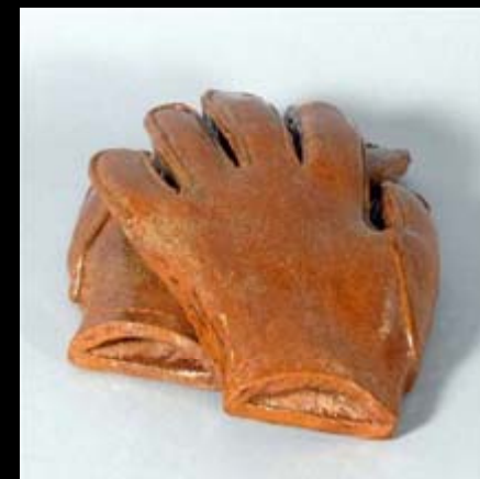
Bedford High School