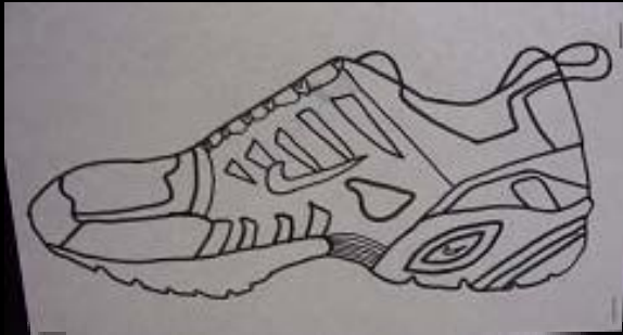
John Glenn Middle School